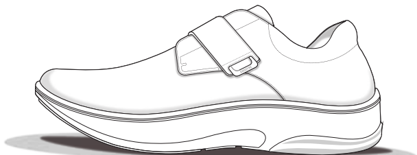
Mild Rocker Sole