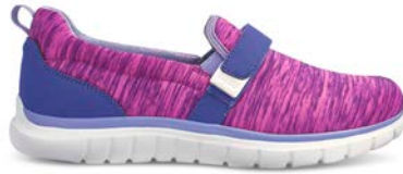
Sport Trainer Purple/Pink