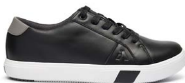
Casual Sneaker Black