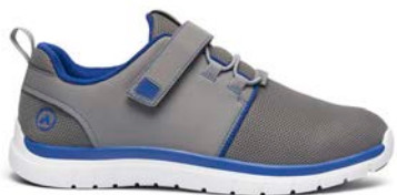
Sport Jogger Grey/Blue