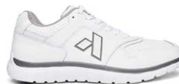
Sport Trainer White