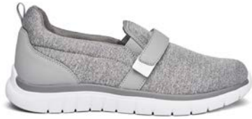
Sport Trainer Grey