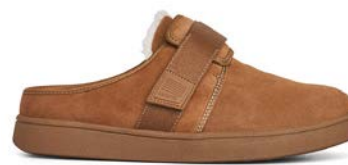
Open Back Camel