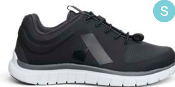
Sport Runner Black/Grey