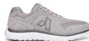
Sport Trainer Grey