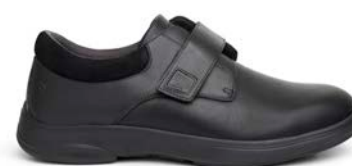
Casual Comfort Stretch Black Stretch