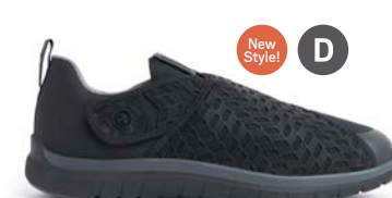
Sport Double Depth Stretch Black