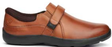
Casual Dress Cognac