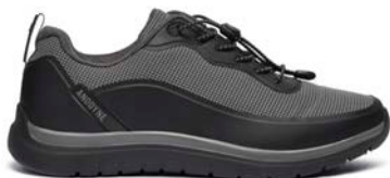
Sport Sprinter Black