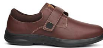
Casual Comfort Whiskey