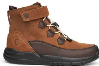
Trail Hiker Almond