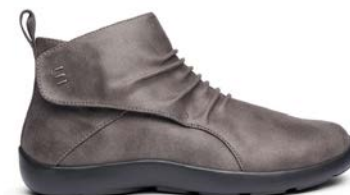
Casual Boot Grey