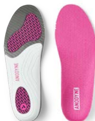
Standard Multi Density Orthotic