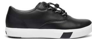
Casual Sneaker Black