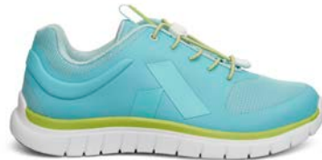
Sport Runner Teal/Lime