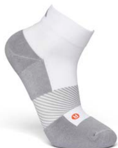
Quarter Length White