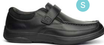
Casual Dress Black