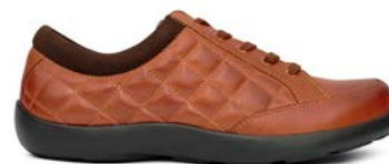
Casual Sport Saddle