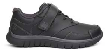
Sport Walker Black