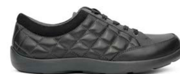
Casual Sport Black