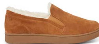
Smooth Toe Camel