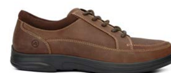
Casual Sport Oil Brown