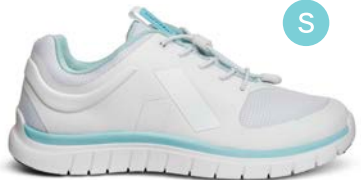
Sport Runner White/Blue