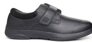
Casual Comfort Black