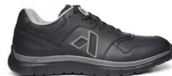
Sport Trainer Black