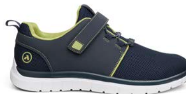
Sport Jogger Blue/Green