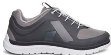
Sport Runner Grey/Black