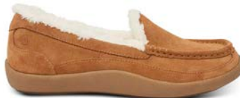
Moc Toe Camel