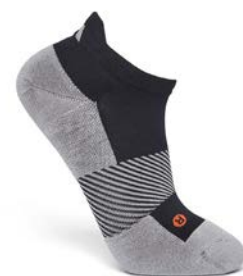
No Show Black