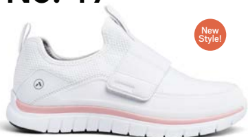
Sport Sprinter White