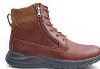
Trail Worker Whiskey