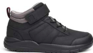
Trail Boot Oil Black