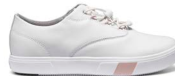
Casual Sneaker White