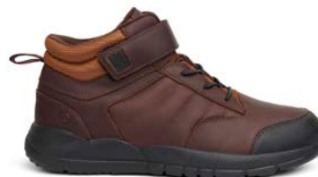
Trail Boot Whiskey