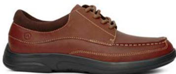
Casual Dress Whiskey