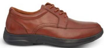
Casual Oxford Burnished Brown