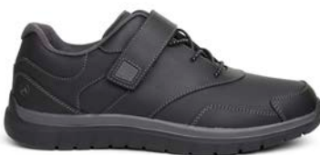
Sport Walker Black