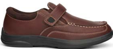
Casual Dress Whiskey