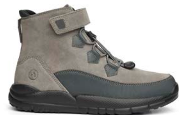
Trail Hiker Grey

The comfort you deserve. The style you desire. The support you require.