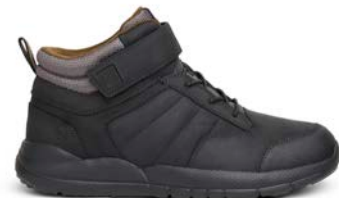
Trail Boot Oil Black