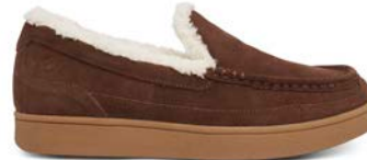
Moc Toe Espresso