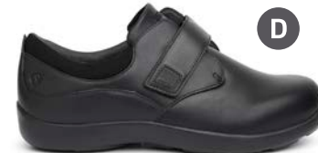
Casual Double Depth Black Stretch