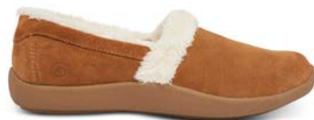
Smooth Toe Camel