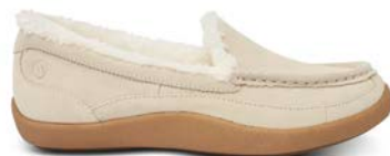
Moc Toe Sand