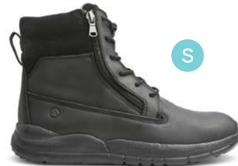
Trail Worker Oil Black