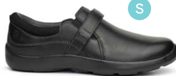
Casual Dress Black