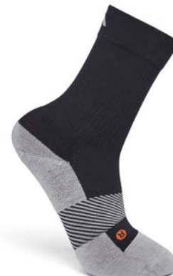
Crew Length Black