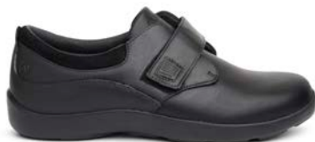
Casual Comfort Stretch Black Stretch