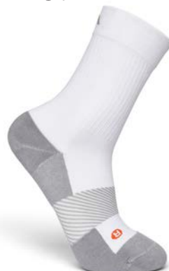
Crew Length White