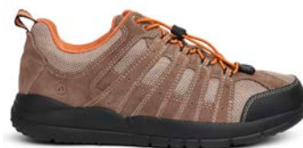
Trail Walker Stone