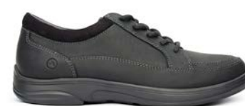
Casual Sport Oil Black