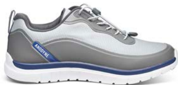
Sport Sprinter Grey