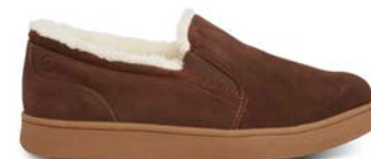
Smooth Toe Espresso