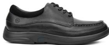
Casual Dress Black