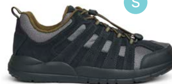
Trail Walker Dark Grey