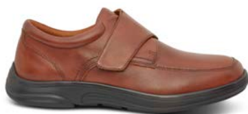
Casual Oxford Burnished Brown