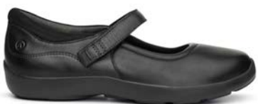
Casual Mary Jane Stretch Black Stretch