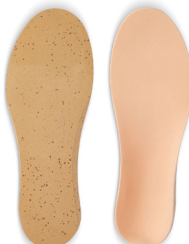
Custom Cork Inserts A5514 Reviewed