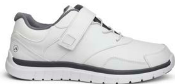
Sport Walker White