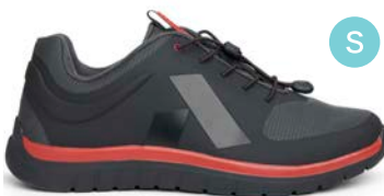
Sport Runner Black/Red