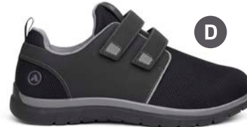
Sport Double Depth Black/Grey