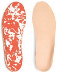
Custom Accommodative Inserts A5514 Reviewed