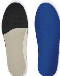
Semi-Rigid Orthotics L3010/3020 Reviewed