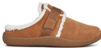
Open Back Camel