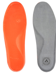
Gel-Foam Hybrid Inserts