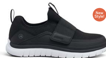
Sport Sprinter Black