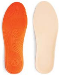
Tri-Lam Heat Moldable Inserts A5512 Reviewed