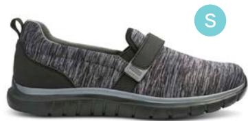
Sport Trainer Black/Grey