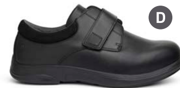
Casual Double Depth Black Stretch