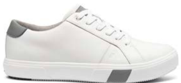
Casual Sneaker White