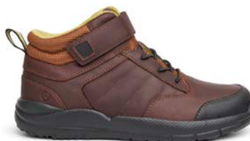
Trail Boot Whiskey