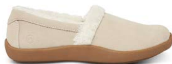
Smooth Toe Sand