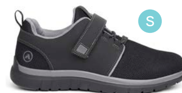
Sport Jogger Black/Grey