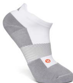
No Show White