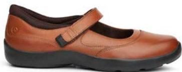
Casual Mary Jane Cognac