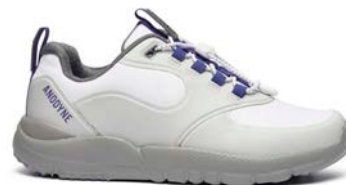
Trail Runner White