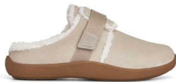
Open Back Sand