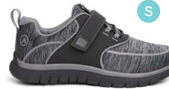
Sport Jogger Black/Grey