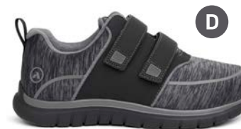
Sport Double Depth Black/Grey