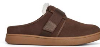
Open Back Espresso