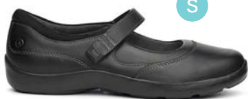
Casual Mary Jane Black