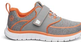
Sport Jogger Grey/Orange