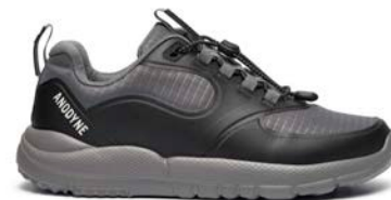
Trail Runner Black