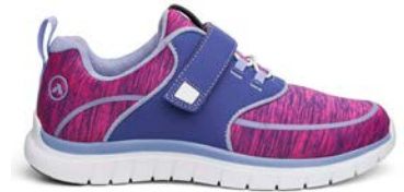
Sport Jogger Purple/Pink