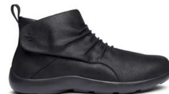
Casual Boot Black