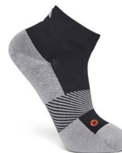
Quarter Length Black