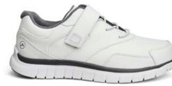
Sport Walker White