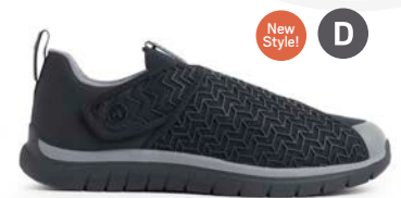
Sport Double Depth Stretch Black