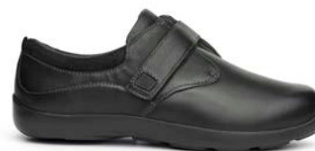
Casual Comfort Black