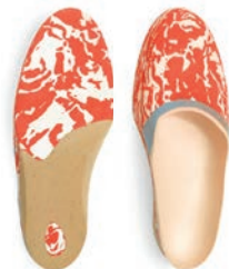
Partial Foot Toe Filler L5000 Reviewed