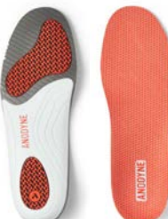
Thin Multi Density Orthotic