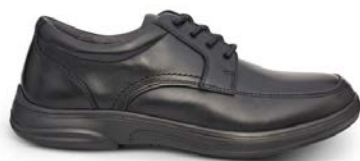
Casual Oxford Black