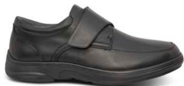
Casual Oxford Black