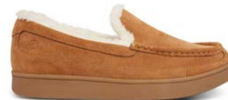
Moc Toe Camel